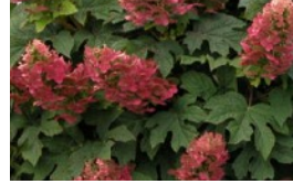
Hydrangea quercifolia Oakleaf: Gatsby Pink, Jetstream, Munchkin, Ruby Slippers, Sikes Dwarf, Snowflake, Snow Queen