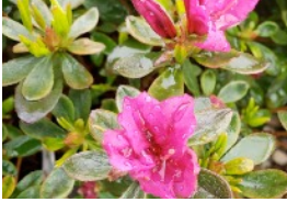
Azalea: 3.17.22 Exbury: Cannons Dbl, Gibraltar, Kylondyke, Mt. St. Helens. Girads: Rose, Purple, Plst White, Fuchsia, Hino crimson & white, Stewartsonian