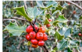
Ilex/Holly Blue Prince, Blue maid, Blue Princess, Castle Spire, Dragon Lady, Blue Prince/Princess combo Japanese Maple Trees- See their own page for list of varieties.