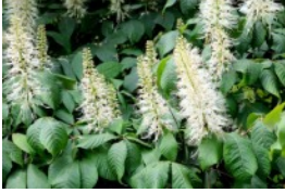
Aesculus parviflora: Bottlebrush Buckeye Multi Stem Tree

Shop Mon-Sat 9-5, Sun 10-5 5728 w. state, near plantation golf course