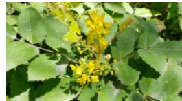
Mahonia Repens/Compact Oregon grape Great for pollinators, grows well under trees