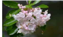
Kalmia latifolia/Mountain Laurel Great evergreen for shade. 3-4'Hx3-4'W