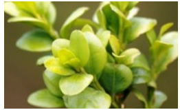
Buxus: Boxwood Graham Blandy, Green- Mtn., Tower, Pillar, Velvet, Petite Pillar, Skywalker, True Dwarf, Winter Gem, Variegated, Winter Gem. Boxwood can tolerate sun