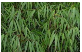
Fargesia: Bamboo clumping Rufa in now 3.17.22, Scabrida later