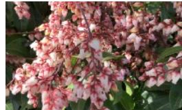
Pieris 3G: Cavatine, Flaming Silver, Mtn. Fire, Valley: Rose + Valentine