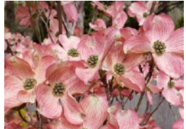
Cornus/Dogwood Tree Cherokee: Brave, Chief, Sunset, Cloud 9, Eddie's White, Milky Way, June Snow, Pink Flowering, Summer Fun, Venus, White Flwr, Wolf Eyes