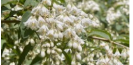
Deutzia Dwarf 2G