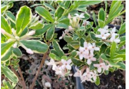
Daphne- upright Carol Mackie, Eternal Fragrance, Summer Ice Daphne cneorum/Rock Daphne- 6-12"Hx24"W