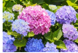
Hydrangea Shrub: Anabelle, Incrediball, Fire Island, Endless Summer: Blushing Bride, BloomStruck, Original, Summer Crush. Oregon Pride Hydrangea anomala: Climbing Hyd