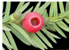
These plants will take sun or shade: Taxus/Yew Amersfort, Dwf Bright Gold, Dk green spreader, Dwf Eng. spreader, Everlow, Hicks, Irish, (*foliage and berries toxic to wildlife/pets, so wrap completely with burlap or frost cloth in late fall thru mid spring, collect berries & throw out) *We can help you choose other plants for river or foothills locations if you need to substitute.

Most shade tolerant plants prefer amended soil, when you plant. ie: acid planting mix Visit us Mon-Sat 9-5, Sun 10-5