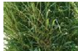
Rhamnus Buckthorn Fine Line, Tall hedge