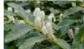
Prunus Laurocerasus/Laurel Chestnut Hill, Dwarf English, Otto Luyken, English, Russian/Skip/Schipka