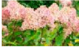
Hydrangea for Sun: Bobo, Berry White, Candy Apple, Diam Rouge, Fire light, Limelight, Little: Hottie, Lime, Lime Punch, Quickfire, Van. Strawberry, White Diamonds. Tree: fire Light, Little Lime, Limelight, Pinky Winky,