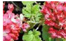
Ribes Sanguineum King Edward Flwr. Currant