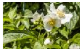
Philadelphus/Mockorange Blizzard, Cheyenne, Snow White