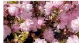
Prunus triloba Pink Flowering Almond