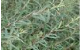
Salix Willow Shrub Dwarf Arctic, Globe Navajo 10G, Iceberg Alley Sageleaf