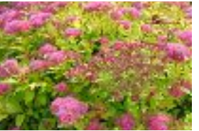
Spiraea Candy Corn, Glow Girl, Gold Flame, Lil Flirt, Pink Sparkler, Sundrop, Superstar