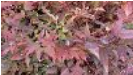
Nandina Heavenly Bamboo Flirt, Obsession, Plum Passion Tuscan Flame