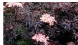
Sambucus Elderberry ornamental Black lace, Lemony lace