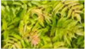
Sobaria Ash Leaf Spiraea Matcha Ball