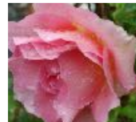
Rose 2G: These roses are compact, perfect in landscapes. All the Rage, At Last, Calypso, Campfire, Caramba, Champagne wishes, Chateau Merlot, Como Park, Coral Cove, High Voltage, Oscar Peterson