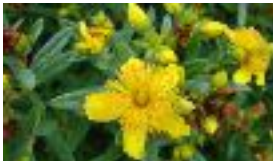
Hypericum St. John's Wort