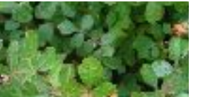
Sumac Low growing: Autumn Amber, Gro-Low