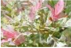
Salix Hakuro Nishiki Dappled Willow