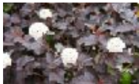
Physocarpis/Ninebark Amber Jubilee, Diabolo, Fireside, GingerWine, Little Devil, Rasp. Lemonade, Summerwine, Spilled Wine