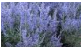
Persovskia A.: Russian Sage