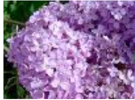
Syringa Lilac Bloomerang, Declaration, Dwarf Korean, Miss Kim, Scent & Scentibility, Sensation, Virtual Violet