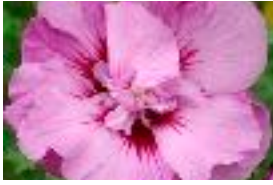
Hibiscus Syriacus Rose of Sharon Many varieties Tree Form: Assorted Colors