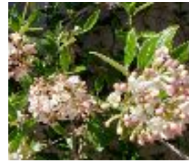
Viburnum Cranberry Bush Autumn Jass, Blue Muffin, Burkwood, Cardinal Candy, Korean Spice, Mariesii Doublefire, Snowball, Summer Snowflake