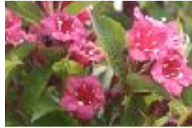
Weigelia Crimson Kisses, Coco Krunch, Dark Horse, Golden Jackpot, My Monet, Shining Sensation, Sonic Boom Red, S. Boom Pink, Tuxedo