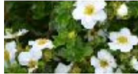
Potentilla Creme Brulee, Marmalade