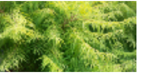
Sumac Upright Staghorn, Tiger Eyes