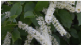
Itea/Sweetspire Little Henry