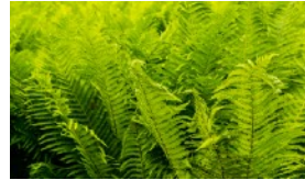
Ferns 1G & QT Japanese Beech, Ostrich, Hart's Tongue, Brilliance, Holly.