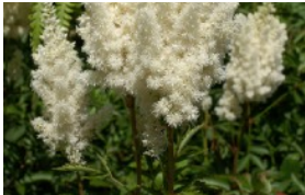
Astilbe 1G Fanal, Moulin Rogue, Vision in Red, Flamingo, Key Biscane, Mighty Choc. Cherry.