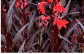
Lobelia 1G Cardinal Flower

5728 W. State, Boise Mon-Sat 9-5, Sun 10-5