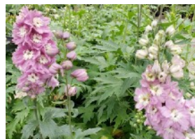
Delphinium 1G Mixed colors