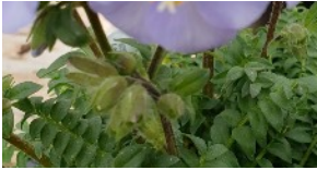
Polemonium 1G Jacob's Ladder Green or variegated