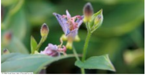
Tricyrtis F. 1G Toad Lily Samurai