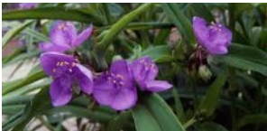
Tradescantia 1G Spiderwort

Availability changes weekly, stop by to shop- Mon-Sat 9-5, Sun 10-5