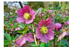
Hellebore 1G 3.15.22 Cream, Green, Pink, Purple, Deep Purple, Blackish Purple Fantastic late winter/spring bloomer w/evergreen leaves