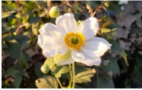
Anemone 1G Windflower Pink Kiss, Honre Jobert