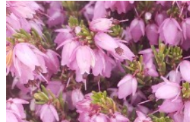
Erica Darleyensis 1G 3.15.22 Mediterranean Heather Pink or White, heavy bloomer