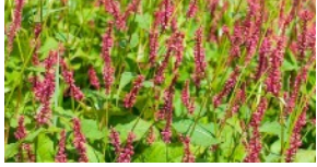
Persicaria P. 1G Fleece Flower Orange field Good for dry shade

Ajuga, gold or green Creeping Jenny, Irish/ Scotch Moss, Lamium, Lobelia, Campanula, Polygotnatum/Dwarf Solomon's Seal, Sweet Woodruff, Lysimachia Chocolate, Ivy Glacier, Black Brass Buttons, Geranium, Vinca