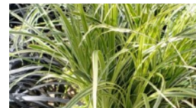
Grasses 1G, Quart, 4" Acorus Ogon, Carex Sensation, Everlime, Japanese Forest: Striped & Golden,