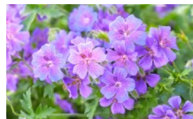
Cranesbill Geranium 1G Johnson's Blue, Pink, White, Violet