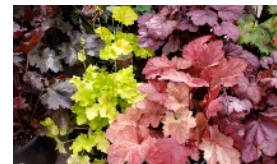
Heuchera Coral Bells 1G Fire Chief, Forever Purple, Georgia Plum, Peach Flambé, Plum Pudding, Marmalade, N. Exposure Red, Midnight Rose