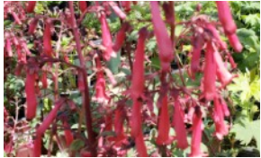
Phygelius r. 1G Hardy Fuchsia Winchester Fanfare