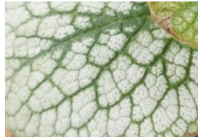
Brunnera 1G Siberian Bugloss Jack Frost, Looking Glass, Sea Heart,