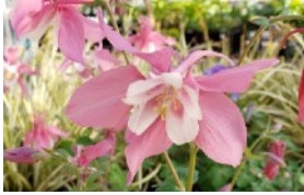
Aquilegia 1G Columbine red, pink, purple, two-toned