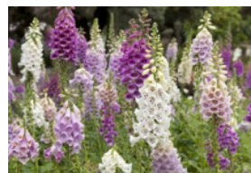
Digitalis 1G Foxglove Mixed colors