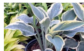
Hosta 1G Krossa Regal, Loyalist, Minuteman, Sum & Subst, Wide Brim, Tropical