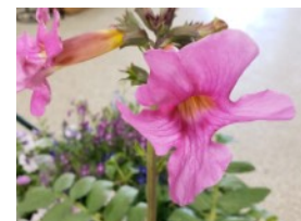
Incarvillea 1G Hardy Gloxina