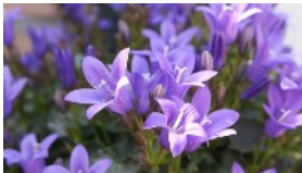
Campanula Bellflower 1G Blue Waterfall, Birch Hybrid- purple, Takion, Superba,